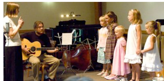
THE UUFM YOUTH CHOIR PERFORMS AT THE 2008 MUSICALE

The UUFM Youth Choir, directed by Sarah Nuss-Warren, rehearses before the morning service on the first and third Sundays of each month. This month, rehearsals are scheduled on Sunday, SEPTEMBER 7 , and SEPTEMBER 21 , in the Inez Alsop all-purpose room (old sanctuary) at 10:15 am. All children and youth are invited to join in our song. Contact Sarah at 537-3586 or nusswarr@gmail.com to learn more.