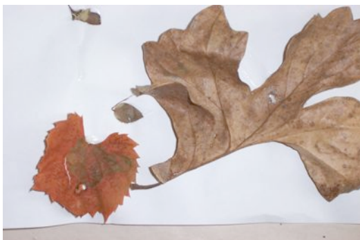
NATURE COLLAGE BY NICK