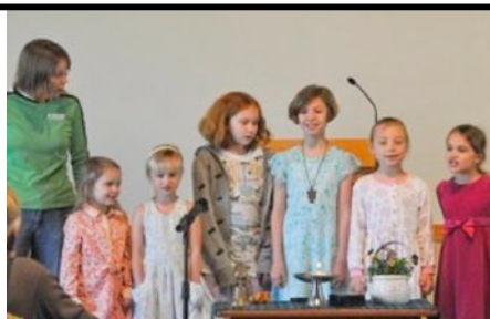
MEMBERS OF THE UUFM YOUTH CHOIR