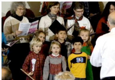
UUFM YOUTH CHOIR W/ADULT SINGERS