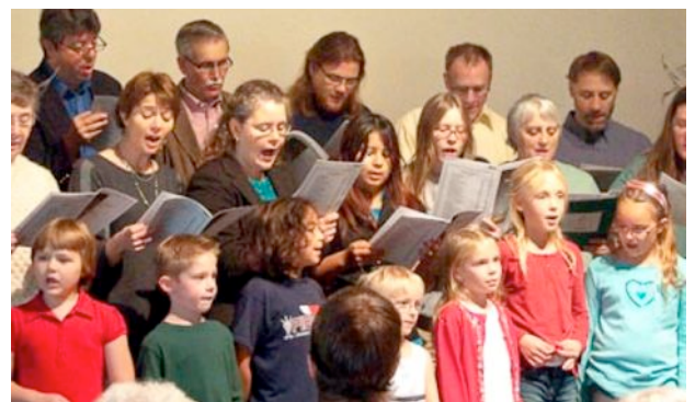
A JOINT PERFORMANCE OF THE UUFM YOUTH AND ADULT CHOIRS DURING THE SUNDAY SERVICE ON NOVEMBER 15, 2009