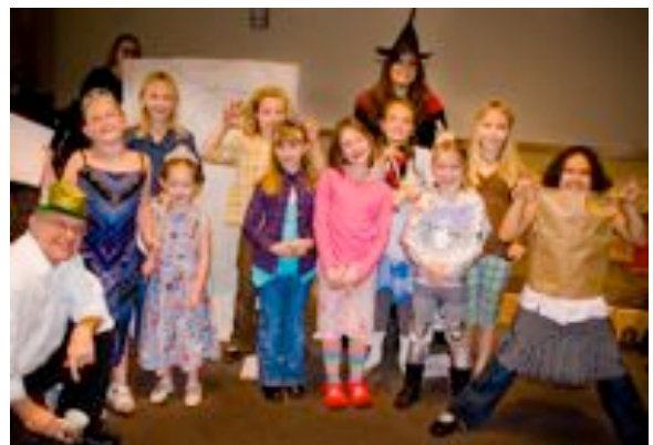
CAST OF THE "WIZARD OF OZ," CREATED AND PERFORMED BY STUDENTS AND ADULTS ON SUNDAY, DECEMBER 13, 2009