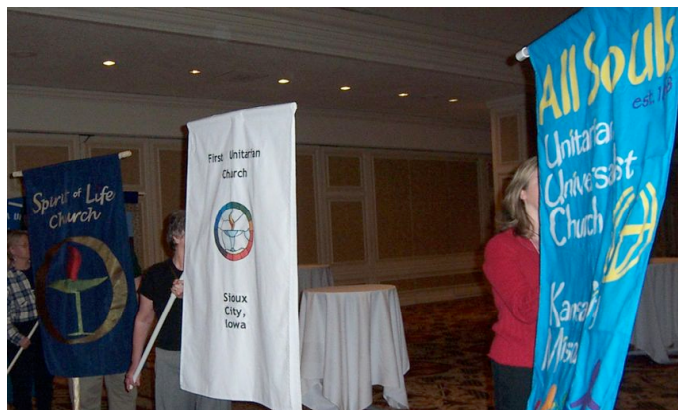
PRAIRIE STAR DISTRICT CONGREGATIONAL REPRESENTATIVES PARTICIPATE IN THE OPENING PARADE OF BANNERS, AT THE PSD ANNUAL CONFERENCE 2005, IN MINNEAPOLIS, MN.