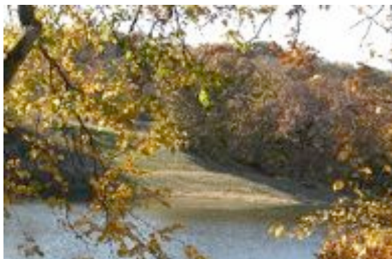
A SUNLIT SCENE ON WATERS EDGE CAMP STARTRAIL, NEAR ASHLAND, NEBRASKA

Information will be posted on the carousel in the narthex as it becomes available, or learn more about Camp StarTrail, Camp UniStar, and Midwest UU Summer Assembly now at www.psdoua.org/Camps