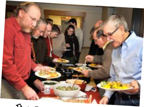
ENTICING FOOD ...