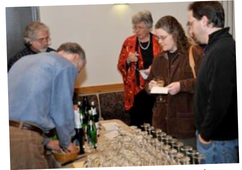
SETTING THE MOOD ...