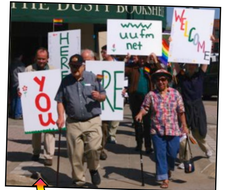
UUFM WELCOMING SIGNS