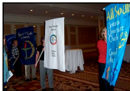
CONGREGATIONS JOIN IN THE BANNER PROCESSION AT THE 2005 PSD ANNUAL CONFERENCE IN MINNEAPOLIS, MINNESOTA.

Do you have a wonderful workshop idea to share at the PSD Annual Conference? The Prairie Star District is seeking workshop applications for the PSD Annual Conference 2012, "Lessons from War & Peace: Stories of Hope, Faith, and Courage," which will be held April 13 thru 15, 2012, in Bloomington, Minnesota. Workshops are sought that respond directly to this theme, or foster leadership development, and/or strengthen our UU community through multigenerational conversation. Information about the conference and workshop applications are available at www.psduua.org/AnnualConference2012 Deadline to apply is Monday, September 26, 2011.