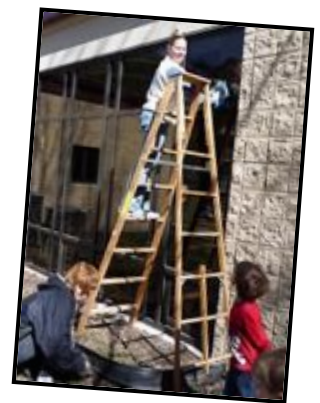
WASHING THE WINDOWS