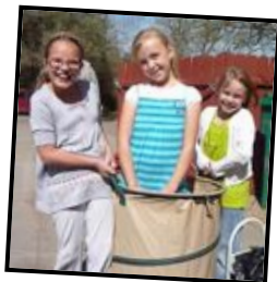
THE KIDS PITCH IN!