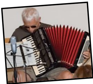
UUFM ROCKS MEMBERS AND FRIENDS SHARE THEIR TALENTS AT PREVIOUS MUSICALES