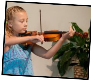
A VIOLIN SOLO AT THE 2010 UUFM MUSICALE.