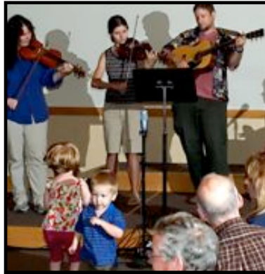
SPONTANEOUS DANCING AT THE 2007 UUFM MUSICALE.