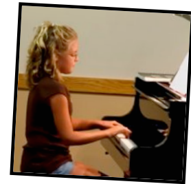
A PIANO SOLO AT THE 2006 UUFM MUSICALE.