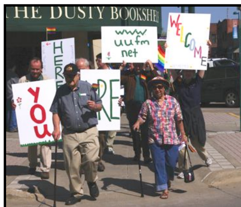
FELLOWSHIP MEMBERS CARRY SIGNS IN THE 2011 LITTLE APPLE PRIDE PARADE.