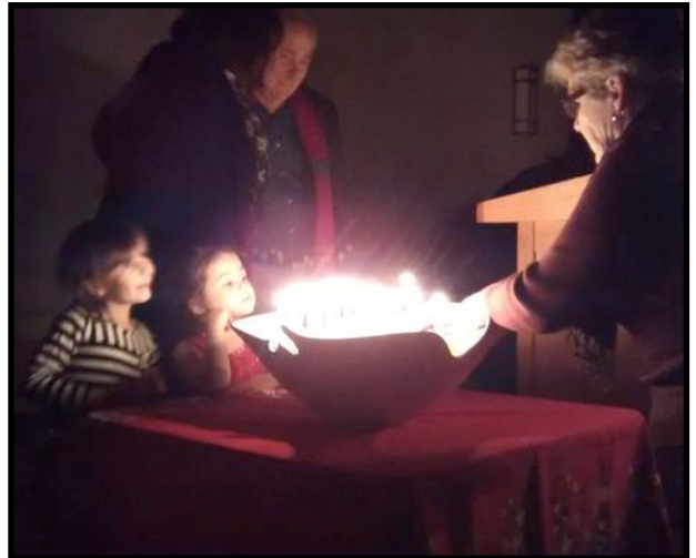
GATHERED IN THE CANDLELIGHT AT OUR CHRISTMAS EVE SERVICE, DECEMBER 24, 2014.