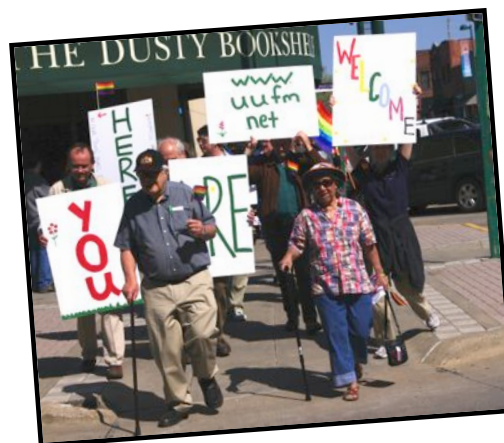
FELLOWSHIP MEMBERS CARRY SIGNS IN THE 2011 LITTLE APPLE PRIDE PARADE.