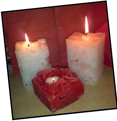
STUDENTS MADE ICE CANDLES IN DECEMBER.