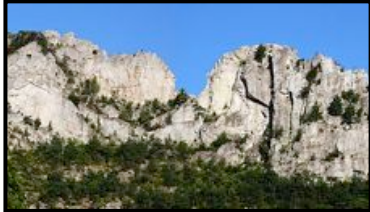
VIEW OF SENECA ROCKS, MONONGAHELA NATIONAL FOREST, WEST VIRGINIA

In our memories, our old homes and hangouts never change. Or maybe they do, as our memories are rarely photographic and our minds are often unreliable on details.