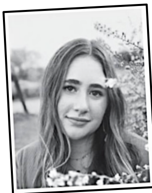
... AND INDIGO.