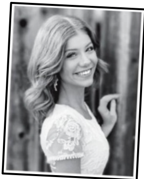
... CARRIE ...

Contact Sandy at 785 341-0135 or dre@uufm.net .