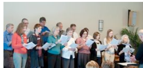
UUFM SINGERS PROVIDE MUSICAL REFLECTION DURING THE SUNDAY SERVICE ON FEBRUARY 27, 2011.