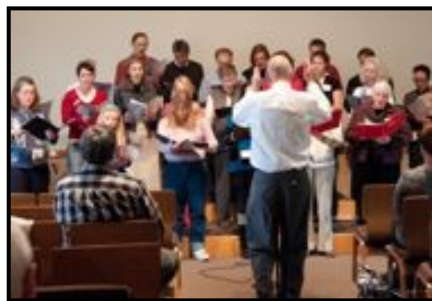
THE UUFM SINGERS GRACE A RECENT SUNDAY SERVICE WITH SONG