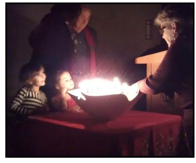
GATHERED IN THE CANDLELIGHT AT OUR CHRISTMAS EVE SERVICE, DECEMBER 24, 2014.