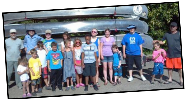
ADULTS AND KIDS PREPARE FOR OUR ANNUAL CANOEING ADVENTURE AT PILLSBURY CROSSING ON JULY 14. NEEDLESS TO SAY, FUN WAS HAD BY ALL!

It'll undoubtedly be hot in August, so let's have some pool fun. Watch for announcements about a UU Free Swim at CiCo Park later in the month.