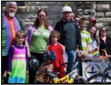
UUFM MEMBERS MEET UP FOR THE 2015 LITTLE APPLE PRIDE PARADE

If home is the first place and work (or school for some of us!) is the second place, the third place is another place