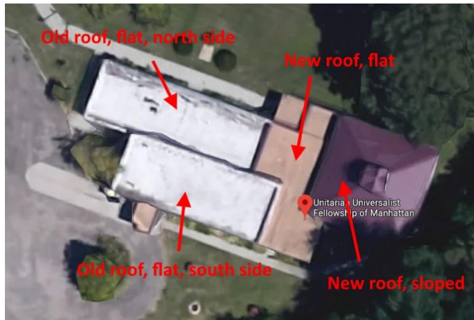
1. The UUFM roofs

We plan to repair the flat roofs over the Alsop room and classrooms. The good news about the roof is that steel trusses support the roof and are in good condition. Also, the roofs are not completely flat, but have a slope that helps drainage. The bad news is that the bottom two layers of the roof structure that rests on the trusses is gypsum, which is susceptible to water damage. The top layer is a wood fiber board with some locations where plywood repairs have been made. The roof covering is bonded to the wood fiber with tar.