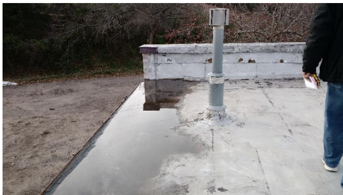
3. The major problem area at the southwest corner of the south roof