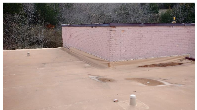
6. Existing newer tan roof. Covering not adhered to base, but mechanically attached.