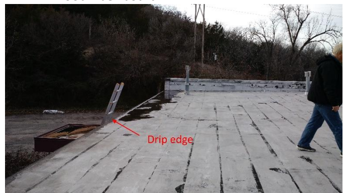
4. The south roof