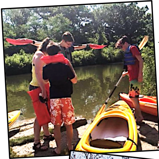
SOME UU WORLD TRAVELERS ADVENTURES IN 2018