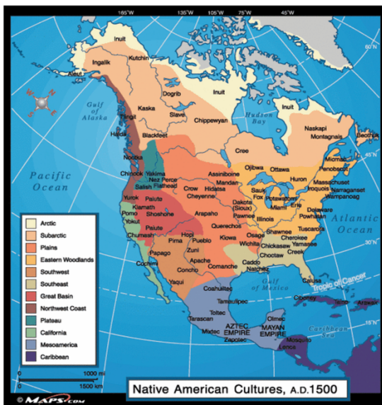
1500 AD - PRE-COLONIAL MAP OF NORTH AMERICA'S INDIGENOUS TURTLE ISLAND

All those interested from the UUFM congregation, the community area, and from anywhere on Zoom are invited to attend this 2019 documentary film created by the Anglican Church of Canada. During its length of 1 hour and 6 minutes, it consists solely of in-depth interviews and discussions with indigenous, Canadian residents. All of them are tribal members who are lawyers, administrators, teachers, other professionals, laborers, elders, youth, mothers, fathers, and clergy.